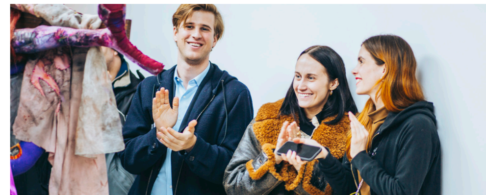
Identity by saul studio / saulstudio.co.uk